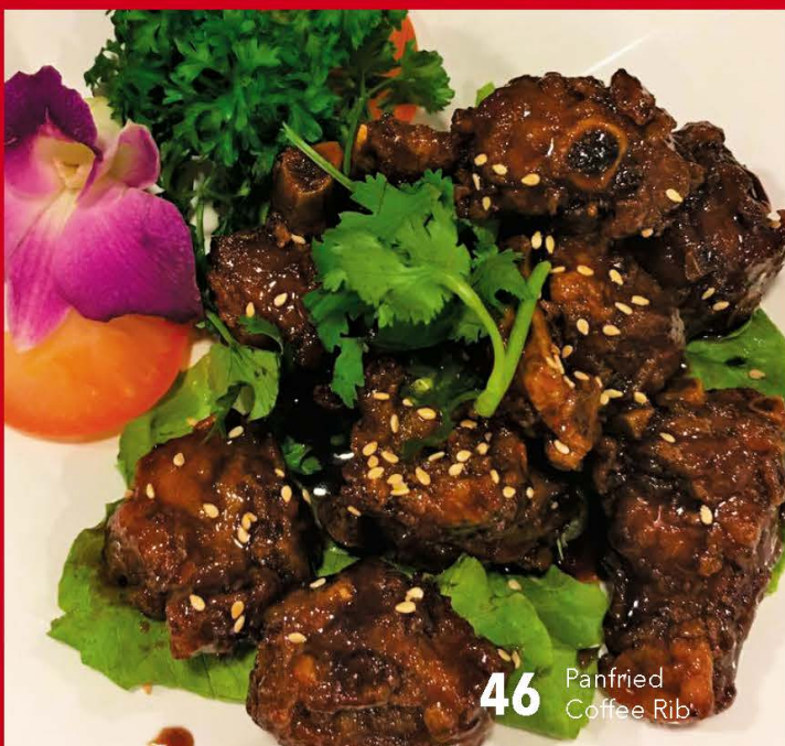
46 Panfried Coffee Rib