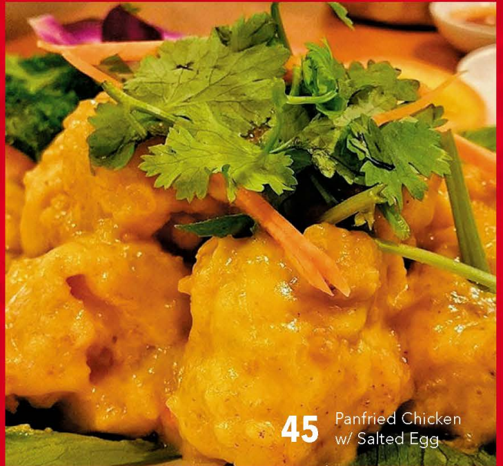
45 Panfried Chicken w/ Salted Egg