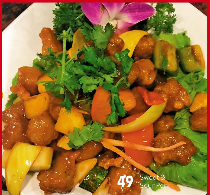
49 Sweet & Sour Pork