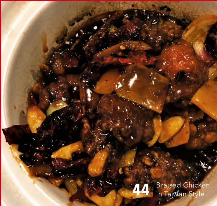
44 Braised Chicken in Taiwan Style

Meat provide the body with essential nutrients, minerals and vitamins in order for it to remain healthy.